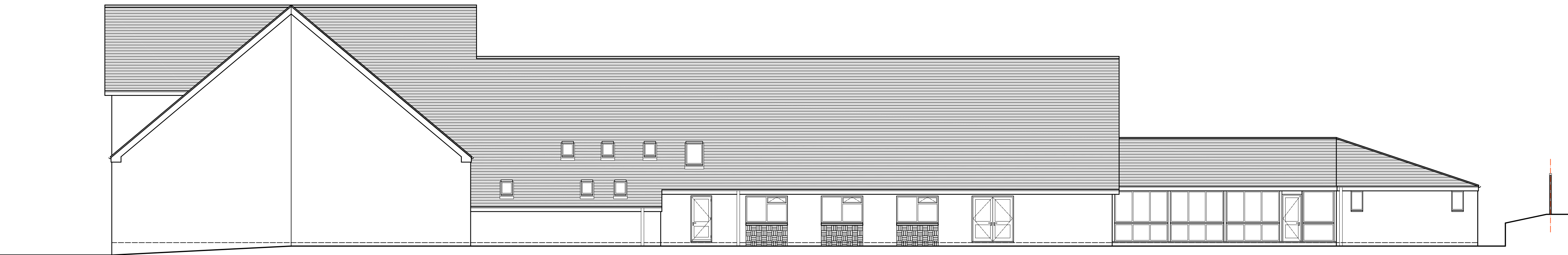
BB 006 Mackworth Community Centre, Mackworth Existing Rear Elevation (South West) 1:100