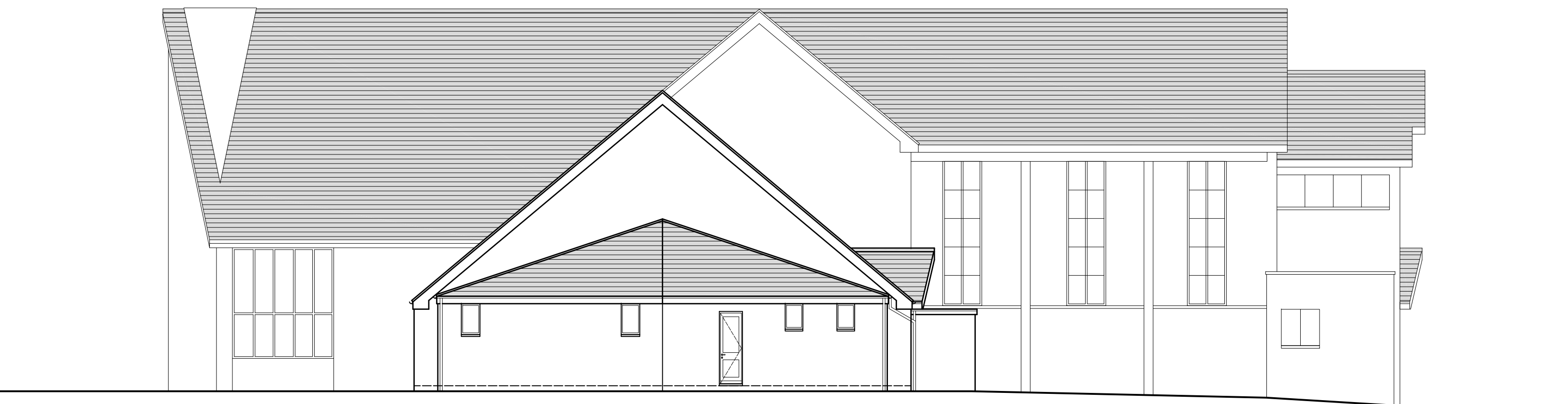
CC 006 Mackworth Community Centre, Mackworth Existing Side Elevation (South East) 1:100