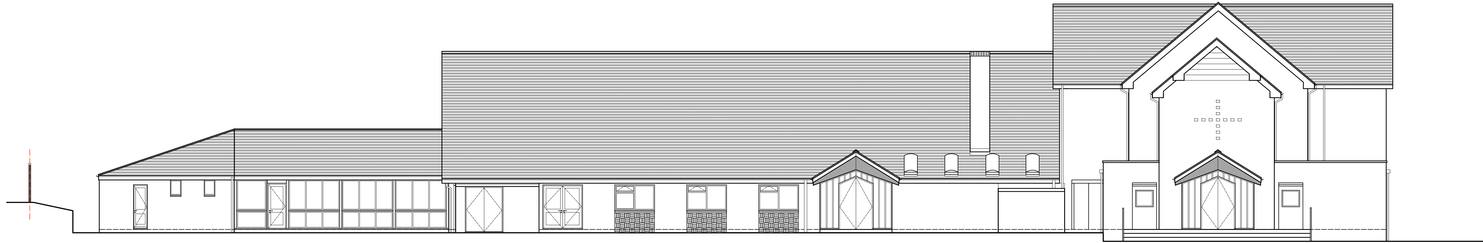
AA 006 Mackworth Community Centre, Mackworth Existing Front Elevation (North East) 1:100